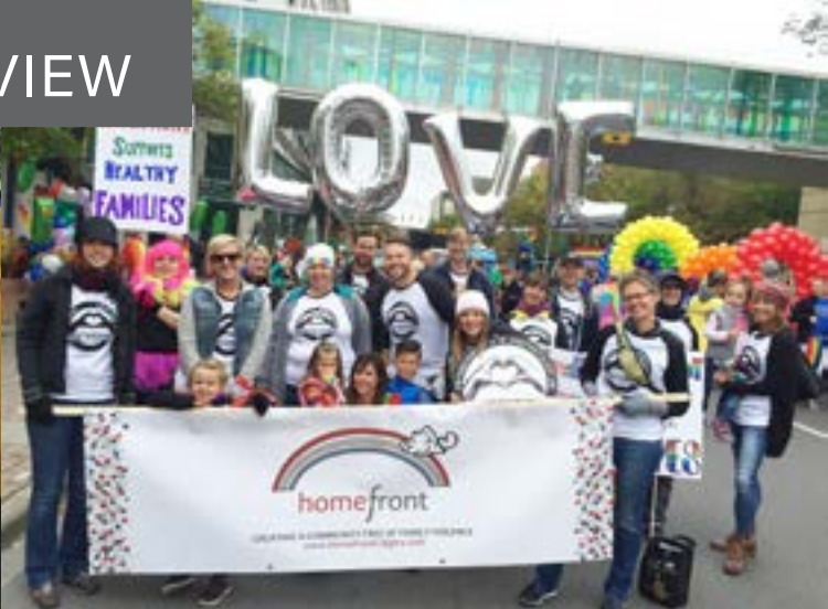
HomeFront participates in our 3rd Calgary Pride Parade