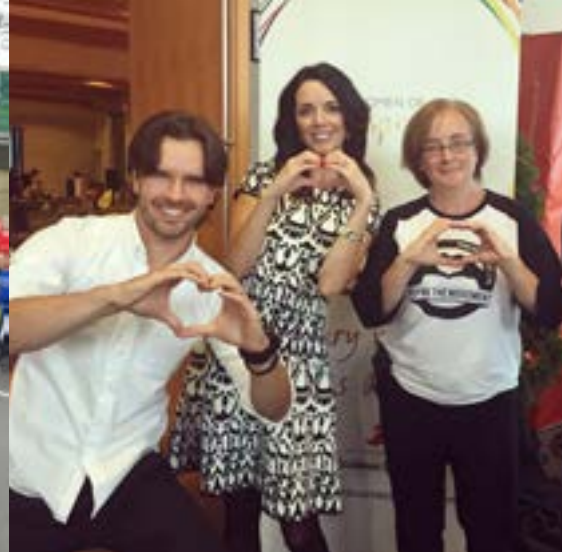
The 2nd Annual Women of Inspiration Event