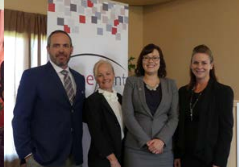
Honourable Minister Kathleen Ganley with HomeFront's Board Co-Chair's and Executive Director